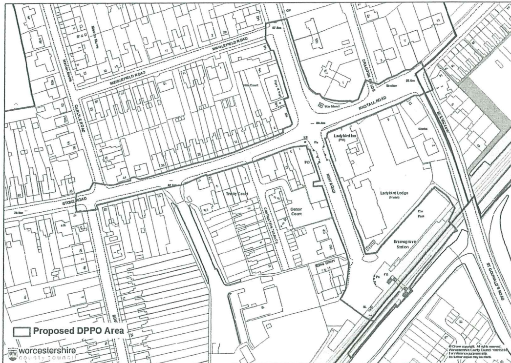
Figure 1: Map to show the location of the proposed DPPO

Incidents and offences recorded as having occurred within 30 metres of the proposed zone have been selected for analysis in order to capture all potentially relevant reports.